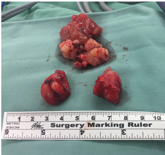
Fig. 1. Nasopharyngeal mass associated with adenoid, as well as bilateral tonsils.

Children with OSA commonly present with snoring generated from upper airway airflow limitation. Typically, airflow limitation originates in the pharynx (tonsils and adenoids), less commonly in